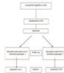
Figure 1. Flowchart of participant in evaluation of the intervention